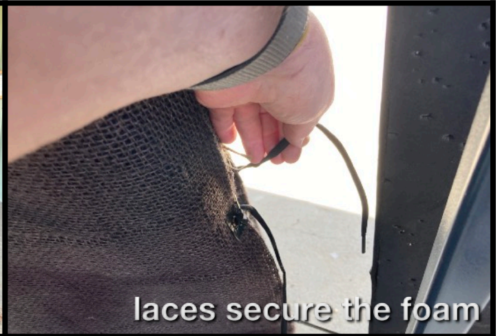
laces secure the foam