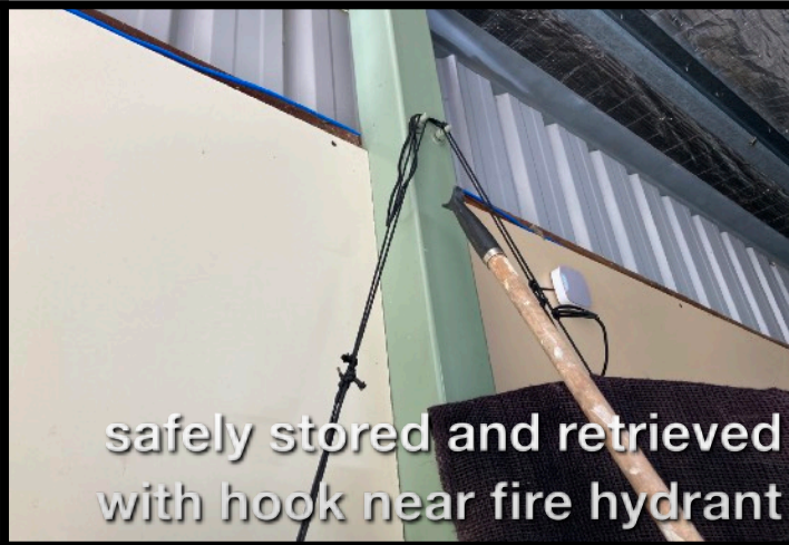
safely stored and retrieved with hook near fire hydrant