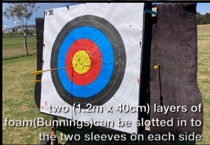
two (1.2m x 40cm) layers of foam(Bunnings)can be slotted in to the two sleeves on each side