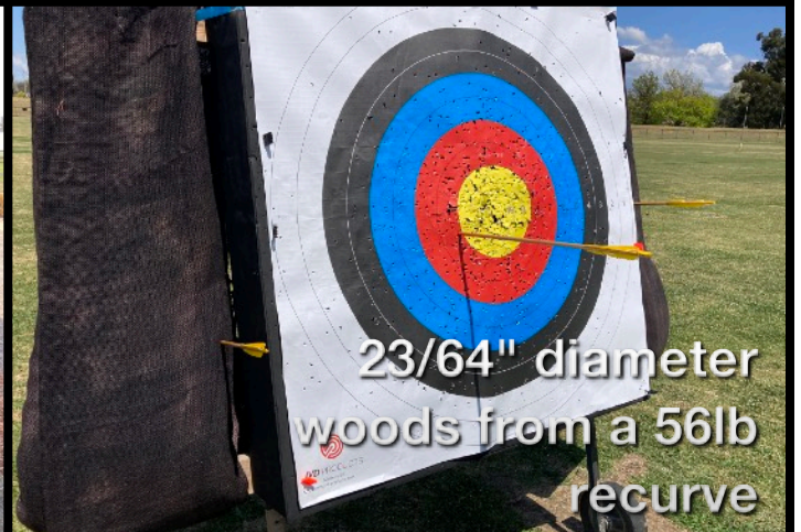
23/64" diameter woods from a 56lb recurve