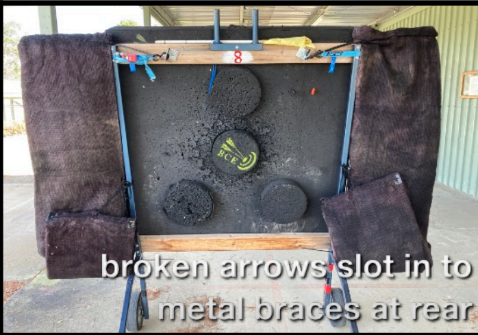
broken arrows slot in to metal braces at rear